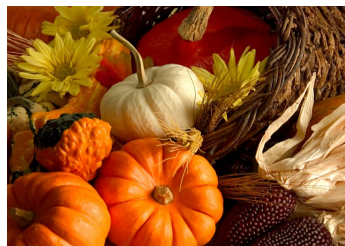
Lord, I am thanking you

thank you right now. I am not going to wait until I get promoted at work or until I get the job, I am going to thank you right now. I am not going to wait until I